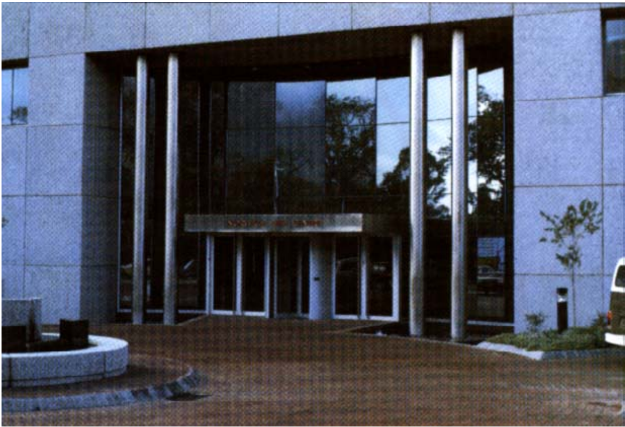
Fig. 9 Norwich Union Building, South Africa.