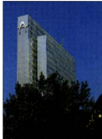
P G Stone

The 1950's saw many other examples of stainless steel curtain walling introduced in North America and elsewhere in the world. For instance, Prof. Dr-Ing. Hentrich's Thyssenhaus in Dusseldorf, Fig 2, was one of the first high-rise buildings in Europe to use stainless steel. Now classified as one of Germany's architecturally important buildings, it bridges the bustle of the city on one side with the tranquillity of the lakes and park on its northern perimeter. The walling is trapezoidally profiled 1.0 mm thick S 31600 stainless steel, with a number 4 finish. Other buildings followed rapidly in Europe and the Orient, Fig 3.