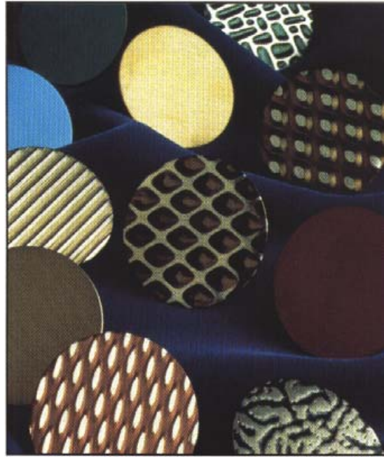
Coloured and embossed, coloured, and highlighted surface finish examples.

In high-traffic areas like public transit facilities, airports and public buildings, there is potential for deliberate or accidental scratching. The random uniform scratch patterns of the distressed and angel hair finishes, embossed finishes and decorative swirl patterns minimize or hide this damage. A wide variety of appearances are available within each of these surface finish categories. While these finishes are utilitarian, they can also be very decorative. The embossed finishes should be considered when additional impact resistance is required. Stainless steel is work hardenable so, when stainless steel is cold worked by embossing, the strength is increased. The additional strength