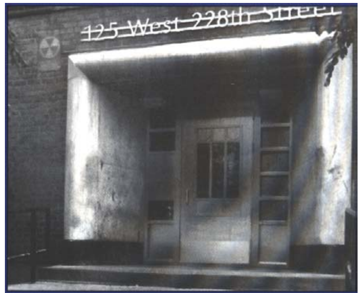
Type 316, all-stainless steel doors on the New York City Housing Authority's Marble Hill Houses.

While many manufacturers have extensive door design experience, additional techni-