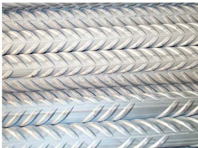
Stainless steel rebar

This layer is formed by the interaction of lime – released by calcium silicates – with iron oxide. The presence of lime maintains the basicity of the environment surrounding the rebar (hydration of the cement produces an alkaline interstitial solution of high pH: 12 to 13).