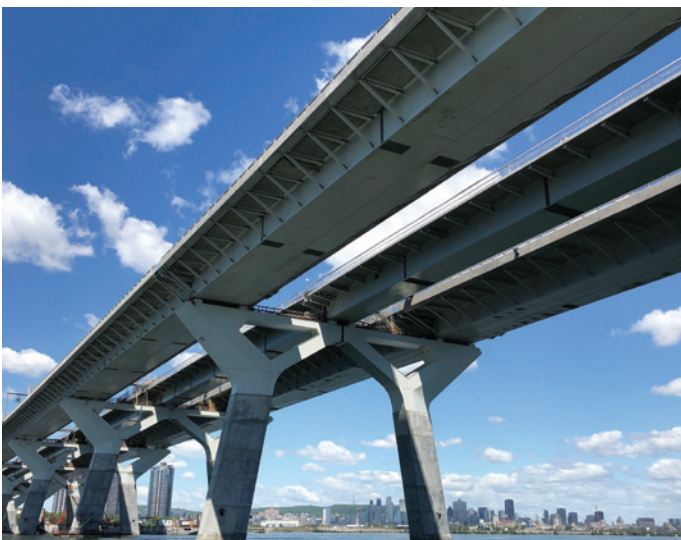
Samuel de Champlain bridge in Montreal