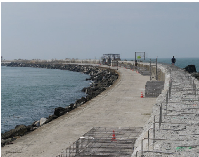
Repair of the Northern Breakwater of the port of Bayonne

Beyond the very comprehensive book 3 , references 11 and 12 offer a range of information and examples about stainless steel reinforcements.