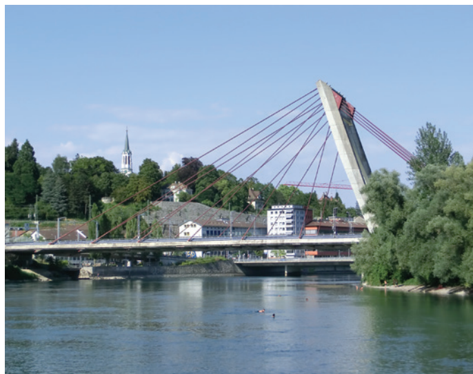
Bridge over the Rhine in Schaffhausen

For most civil engineering projects, a complete substitution of steel rebar by stainless steel rebar is not justified. A small proportion of stainless steel rebar is sufficient to significantly extend the durability of the structure. Finally, only those reinforced concrete structures for which maximum durability is desired (such as heritage structures) and/or on which any maintenance or repair work is impossible, or if it is difficult to carry out, or for which it is impossible to interrupt traffic for repairs would benefit from