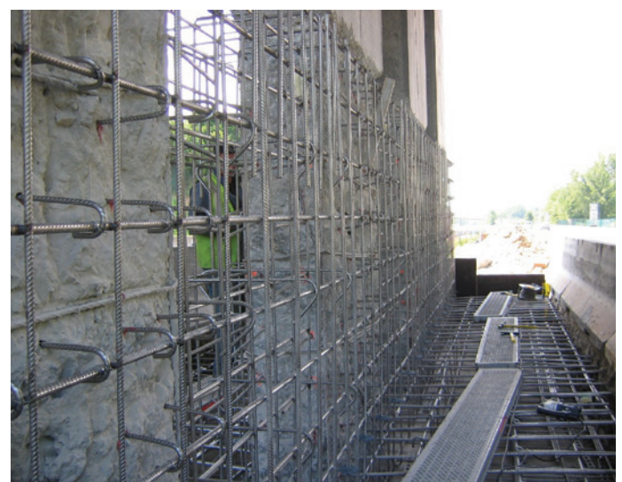
Repair of the central pier of a highway bridge