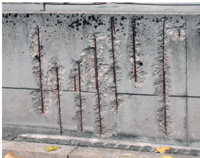
Corrosion of reinforced concrete following the use of deicing salts