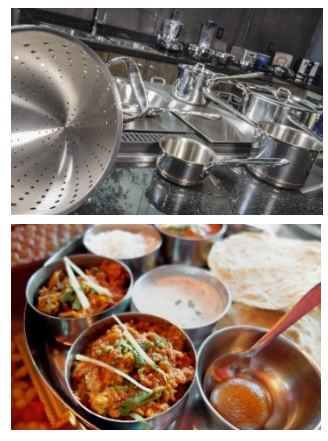
Stainless steel kitchenware utensils are used in commercial and high-end kitchens

European Food Safety Authority (EFSA), in its 2015 Scientific Opinion<sup>(19)</sup> on nickel in food and drinking water, concluded that exposure via the diet is likely to represent the most important contribution to the overall exposure in the general population. The highest concentrations of nickel have been measured in wild growing edible mushrooms, cocoa or cocoa-based products, beans, seeds, nuts, and grains<sup>(19),(20),(21)</sup>.