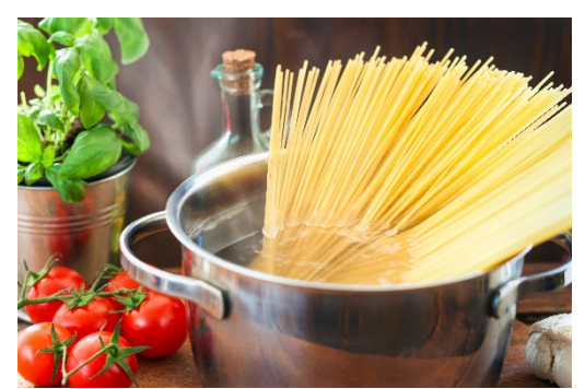
Stainless steel pots provide a safe way to prepare food

This fact sheet provides information on the exposure to nickel via food contact materials and articles, the existing state of knowledge regarding its potential impacts, and the protection offered to consumers by regulations and other means. The general public expect food for human consumption to be wholesome, nutritious, and above all, safe to eat. Indeed, food regulations across the globe that govern food contact materials and articles all share the common theme of consumer safety. Nickel-containing stainless steels are one of the most widely used food contact materials. Release of nickel is required for human exposure and toxicity to occur. Established test protocols offer a means of estimating the release (migration) of substances into food under controlled conditions. Well-designed and well-executed studies on commonly used stainless steel food contact materials and articles indicate that the amount of nickel transferred into food is very small, especially in comparison to the naturally occurring levels in many foods and within the release limits set for food contact materials and articles.