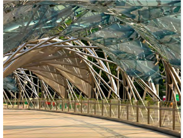
Figure 3: Pedestrian view through the bridge, including shelter panels (Photo: Arup)

The bridge was designed using BS 5950 [1] in combination with a design guide from the SCI [2]. The resulting bridge comprises two delicate helix structures that act together as a tubular truss to resist the design loads. This approach was inspired by the form of the curved DNA structure. The helix tubes only touch each other in one position, under the bridge deck. The two spiralling members are held apart by a series of light struts and rods, as well as stiffening rings, to form a rigid structure. This arrangement is strong and ideal for the curved form. The stainless steel bridge is met by concrete abutments at either side.