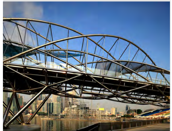
Figure 4: Complexity of the opposing helices