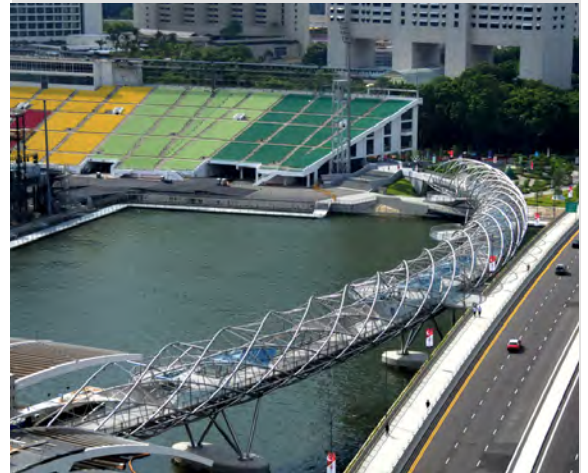
Figure 8: Finished bridge in service

The delivery of material from Europe involved highly customised tubes and plates to meet the project's exacting product and logistic requirements. The main challenge during erection was to maintain a 50 m wide navigational channel with a safe overhead clearance for marine vessels. A temporary structural steel bridge was installed across the channel to enable erection of the permanent structure. Installation of the helix bridge began with the lower deck components and completed at the highest level of the bridge. This includes erection of the major and minor helices which were welded on-site and all the light struts and tension rods that hold and join the helices together using pins. Connecting the different components presented the biggest erection challenges and necessitated constant monitoring and checking.