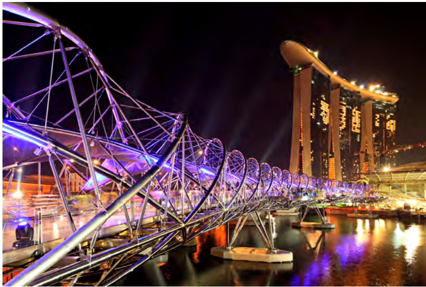
Figure 1: General view of the Helix Bridge

Singapore has a dense urban environment with local planners placing a noticeable emphasis on quality urban design. Designers are encouraged to use sustainable, low maintenance and aesthetically pleasing materials. This can be challenging as the environment is hot, humid, industrial and coastal which can place significant demands on materials for both structural and architectural applications. Stainless steels give designers a good option to meet these demands as they are corrosion resistant materials and, provided the choice of grade is appropriate for the application, are a durable low maintenance solution.