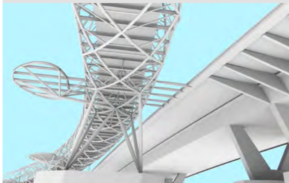
Figure 6: Schematic of the bridge details

The 280 m bridge is made up of three 65 m spans and two 45 m end spans. If the steel were stretched out straight from end to end, it would measure 2.25 km in length. The major and minor helices, which spiral in opposite directions, have an overall diameter of 10.8 m and 9.4 m respectively, about 3-storeys high. The outer helix is formed from six tubes (273 mm in diameter) which are set equidistant from one another. The inner helix consists of five tubes, also 273 mm in diameter. Over the river, the bridge is supported by unusually light tapered stainless steel columns, which are filled with concrete. The columns form inverted tripod shapes which support the bridge above each of the pilecaps. The bridge weighs around 1700 tonnes in total.