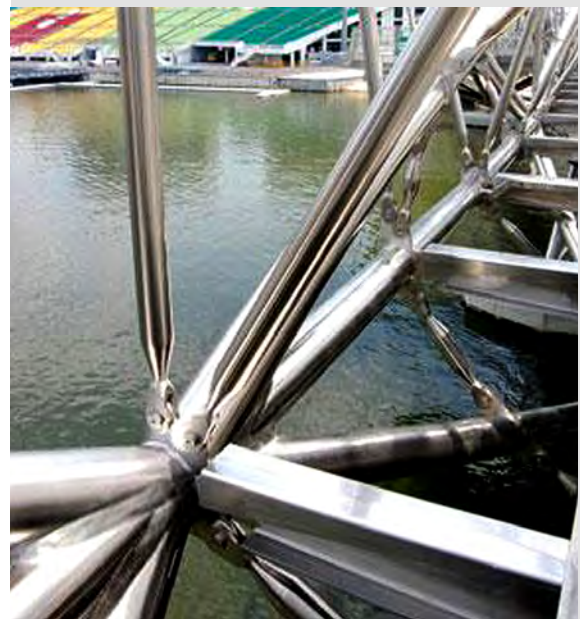
Figure 5: Connection included welded and pinned joints